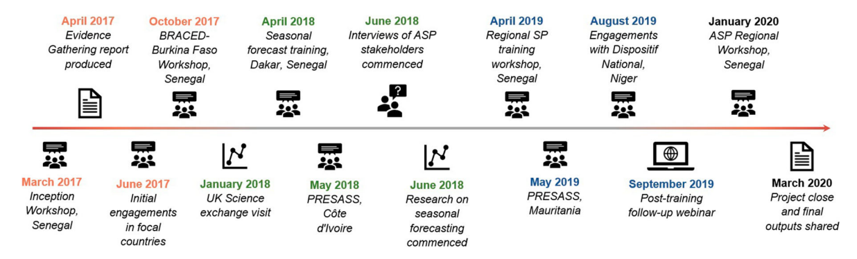
Figure 1. Timeline of key events and activities in ASPIRE.

5. Support to PRESASS to enhance seasonal forecasting approaches and raise awareness of the information needs of social protection programmes.