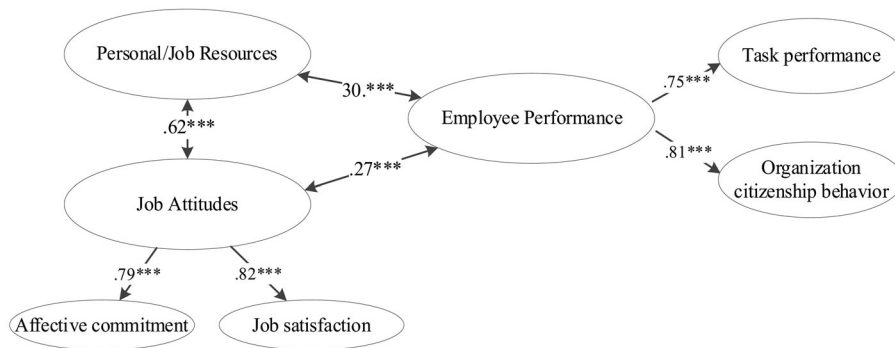
Figure 2. Measurement model of mediator and employee performance variables. N = 8,509 employees, standardized regression coefficients are shown *** p < .001 .