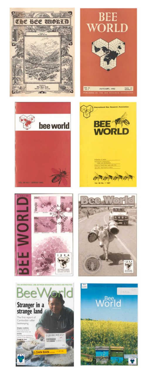
▲ Figure 1. Different appearances of Bee World in the past starting with the first issue 1919 top left. Volume 33 (1952), Vol. 49 (1968), Vol. 68 (1987), Vol. 73 (1992), Vol. 82 (2001), Vol. 85 (2004), Vol. 87 (2010).

The Bee World from his base in Egypt. It gently drifted along supported by the enthusiasm of the Apis Club members and in particular one or two affluent beekeepers. The journal now had an established pattern including serious original articles, reports from supporting associations and features which were to remain for