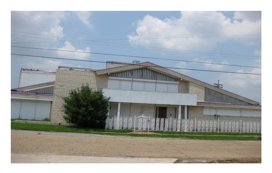
Figure 1. Fatz Domino's home in New Orleans