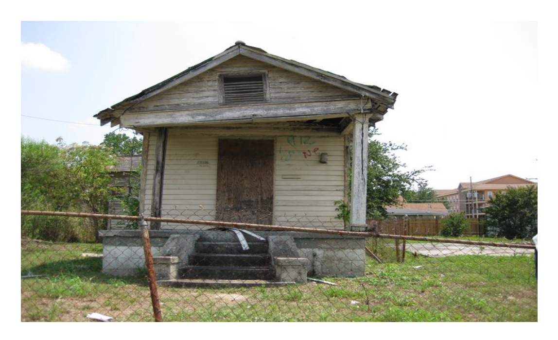
Figure 3. The X Code outside of a ruined home in the Lower Ninth Ward in New Orleans search of the home had been made and the search party had exited the domicile. The numbers above the X denoted the date and time the search took place. The markings to the left of the X stated the affiliation of the search party. The markings to the right of the X indicated hazards within the home. Finally, the markings below the X indicated the number of living and/or dead residents remaining within the structure ("National Urban Search & Rescue Response System 5-6). The X codes that remained on the outsides of these homes were unintended memorials, a narrative of the havoc and destruction wrought by Katrina told in the language of meaningful symbols.

I also drove to the long deserted Six Flags New Orleans Amusement Park (Figure 4), entering the parking lot, though afraid to proceed beyond the signs warning, "No Trespassing." I marveled at the remaining structures seen beyond the front gates of the park, read the graffiti covering the exterior walls and gates, ruminated on the absolute silence and solitude of the park. The faded sign in front of the park retained the ominous words, "Closed For Storm" (Figure 5). Here was another unintended memorial of Katrina's destruction.