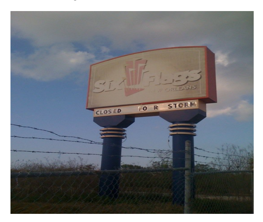
Figure 5. Six Flags park in New Orleans: "Closed For Storm"

Then I read When the Water Came: Evacuees of Hurricane Katrina . The interviews with survivors of the flood were formatted as poetry and accompanied by images. In it, Miriam Youngerman Miller's account begins: