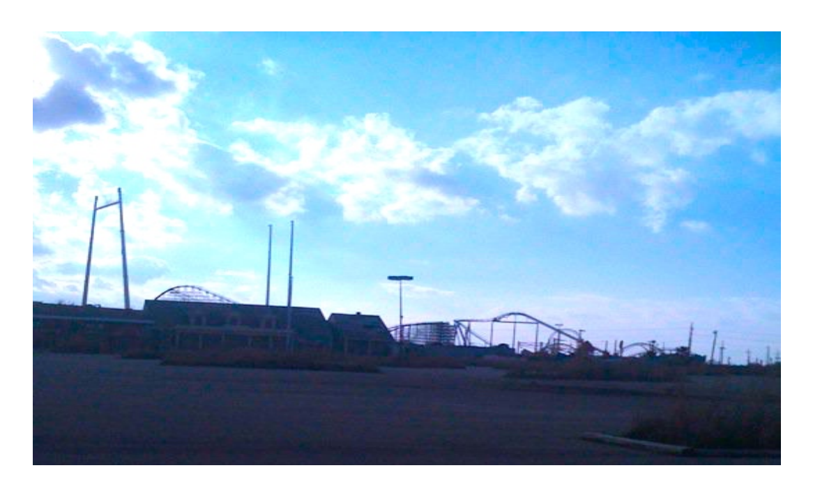
Figure 4. The abandoned Six Flags Park in New Orleans