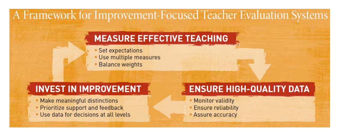
Figure 7. Framework for Teacher Evaluation (MET Project, 2013).

will enhance the evaluation process and promote teacher effectiveness in the classroom (see Figure 7).