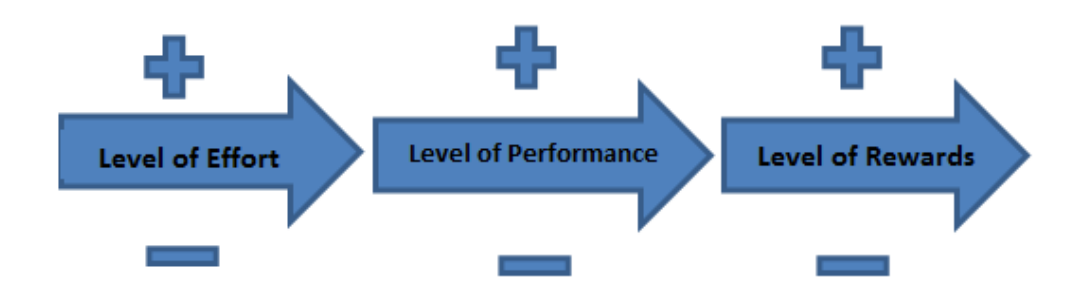
Figure 5. Levels of E x I x V = Level of Motivation.

If a person is motivated to the degree that his/her effort will lead to an acceptable performance (expectancy), the performance will be rewarded (instrumentality), and that the value of the reward is highly positive (valence), then the level of effort will likely be equal to the level of performance and, in turn, that level of performance will be equal to the perceived level of rewards (Lunenburg, 2011) (see Figure 5). The researcher created a figure to illustrate the level of motivation using the Expectancy Theory components. The outcome level of effort, performance, and rewards equals that of the motivation the employee has to continue the job. The key in this theory "lies the expectation that action X leads to outcome Y" (Gratz, 2009, p. 161). It is this expectation that impacts motivation and attitudes. Vroom identified that "positive attitudes toward the job are conceptually equivalent to job satisfaction and negative attitudes toward the job are equivalent to job dissatisfaction" (Vroom, 1964, p. 99).