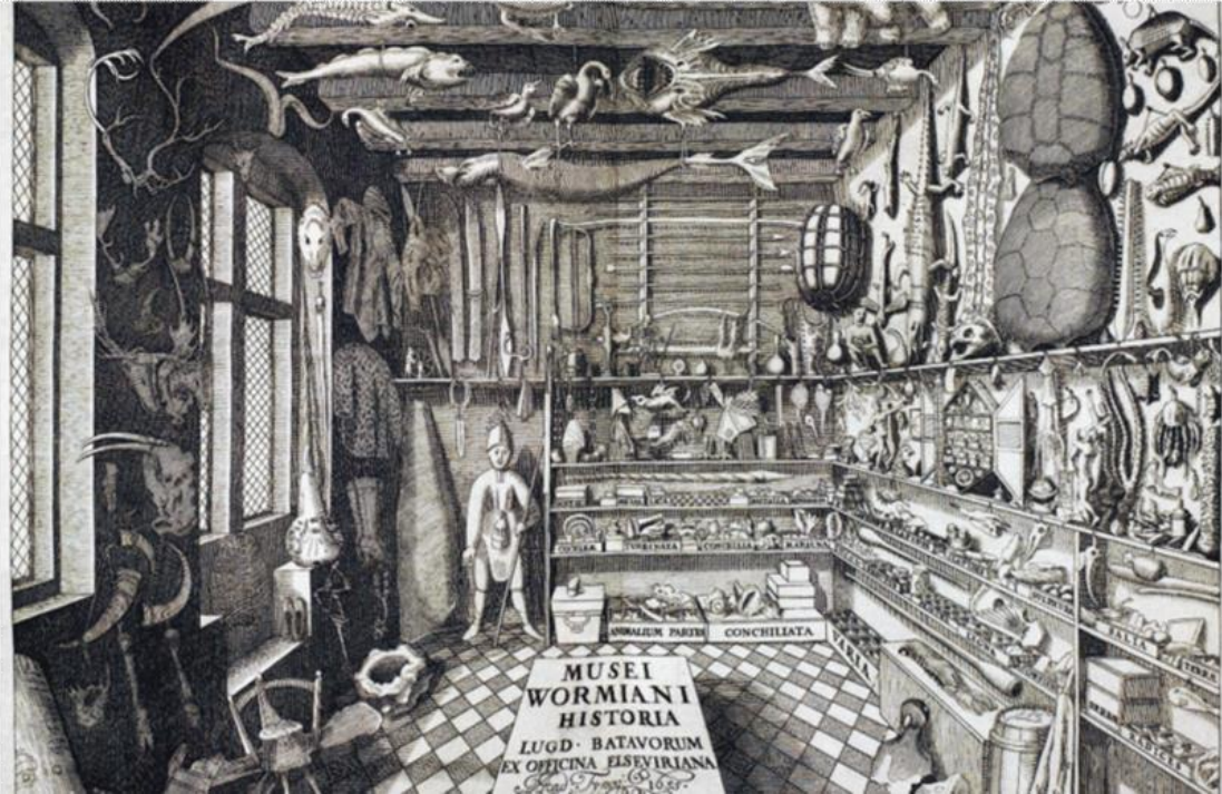
Figure 1: Ole Worm's museum, Olaus Worm, Museum Wormianum seu Historia Rerum Rationum (Leiden, 1655).