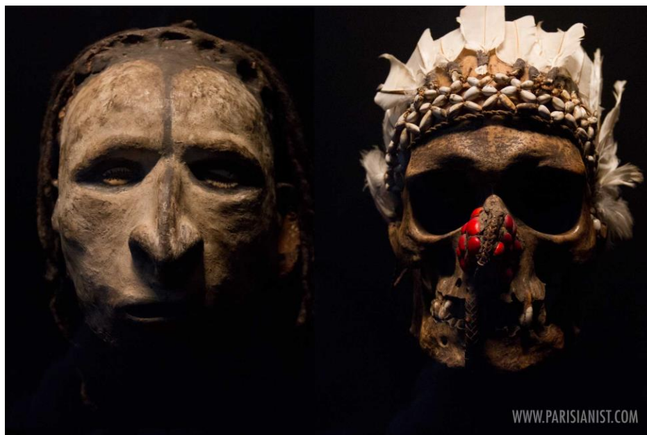
Figure 3: Masks in the Musée du Quai Branly-Jacques Chirac . Aesthetic display in the museum.

about 370,000 objects “originating in Africa, the Near East, Asia, Oceania and the Americas...from the Neolithic period (+/-10,000 B.C.) to the 20th century.” 29 The museum’s collection is organized by region, similar to other museums like the University of Pennsylvania Museum and the Metropolitan Museum of Art. From a brightly lit, winding hallway, visitors enter the galleries displaying the objects (Figure 3). The galleries are dimly lit owing to the fragility of the colors and materials of many of the objects. 30 It is a drastic difference from the bright tunnel to the dark galleries, which seems to have been an aesthetic choice on the part of Jean Nouvel, the building’s architect. The dramatic lighting “presents the works in their own intimacy”, emphasizing their aesthetic qualities. 31