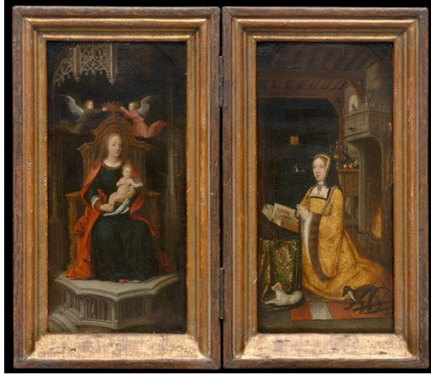
Figure 2: Anonymous Master, Diptych with Margaret of Austria Worshipping the Virgin and Child.

We do not know how Margaret's collection was displayed but we do know that the display elicited an aesthetic response. Upon visiting Margaret's collection in the early 1500s, Peter Martyr d'Anghiera, an Italian humanist and historian of the New World, wrote, "I do not know how to describe the panaches, the plumes, the feather fans. If ever artists of this sort were ever ingenious, then these savages certainly are.... In my opinion, I have never seen anything whose beauty can more delight the human eye." 18 In this quote, Martyr's deep appreciation of the objects as well as his attitude of Western superiority can be clearly seen; he calls the native people artists and savages in the same sentence. Based on Martyr's reaction, it is clear that as early as the sixteenth century, ethnographic objects could be considered art while also evoking other associations.