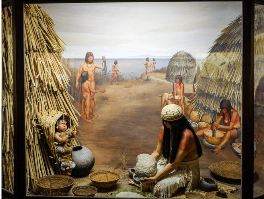
Figure 4: Chumash baby and woman mannequins demonstrating basket weaving at the Santa Barbara Museum of Natural History.

The display is an attempt to recreate the environment in which the objects would have been used in daily life. However, the painted background seems stagnant and phony, and this, combined with the static mannequins, does not help to contextualize the objects or the culture. The Chumash people are passionate about environmental issues as their ancestors subsisted on the land, utilizing plants, animals, and other parts of nature to survive. However, there is no indication of the environment's importance to the Chumash people in the museum's display. There are several thousand Chumash descendants living in the California area today; in fact, the descendants have recreated a functioning Chumash village in the tribe's original location. 47 To better display their Chumash objects, the Santa Barbara Museum of Natural History could work with the existing Chumash people in order to reinterpret their collection in a post-colonial