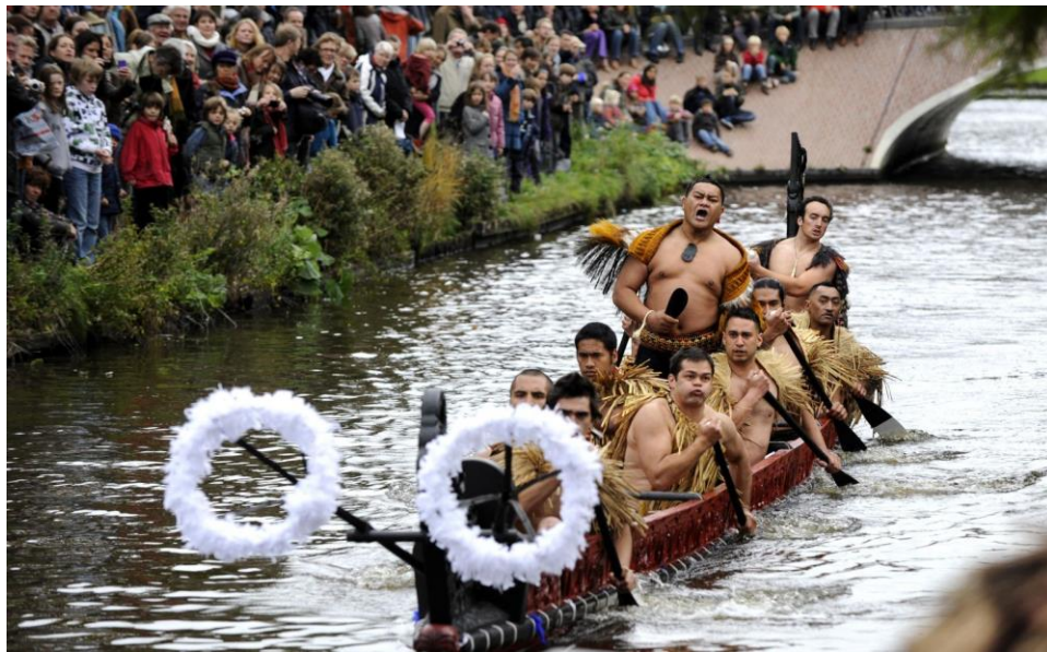
Figure 7: Te Hono ki Aotearoa waka taua crewed by Toi Māori kaihoe (paddlers) during the waka handover ceremony in Leiden, Holland.

The Volkenkunde has also made a visible effort to include current members and descendants of non-Western groups in displaying ethnographic objects and demonstrating their use. One example is the Maori waka that sits in the water next to the museum (Figure 7). In the past, the museum has hosted a Maori weekend, during which local Maori sail the waka and demonstrate different aspects of their culture. 64 Inside the museum, a case displaying ceremonial dress shows visitors how the pieces are meant to be worn, using two tracings of a male and a female placed on the glass case, with the pieces displayed within the case lined up with where they would be worn on the body. This information was given to the museum in consultation with the group who originally owned the ceremonial costumes. The museum acknowledges the importance of the input of the people to whom their objects originally belonged in order to display their collection in the post-colonial context.