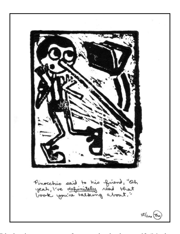
Figure 3 . Handmade woodblock print sent as part of a pre-order thank-you gift (Manley, personal communication September 2013).

The community commiseration of Manley's stories is meaningless without that community, all commercial and profitable aspects aside.