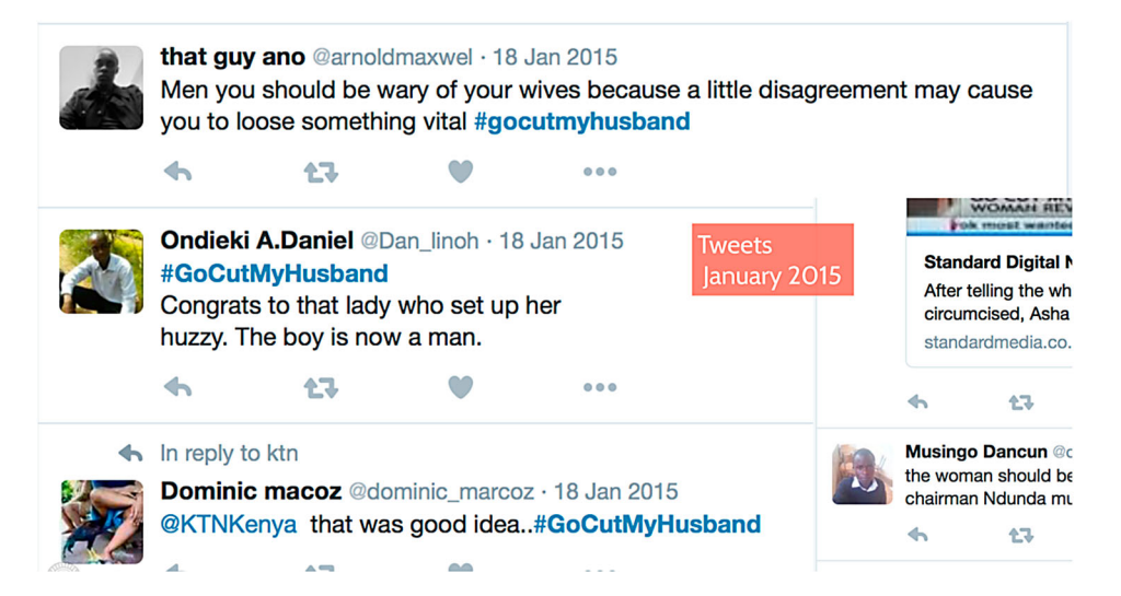
Figure 1. Twitter, #gocutmyhusband.<sup>26</sup>

In a media-saturated world, a Twitter hash tag like #gocutmyhusband might easily have slipped away unnoticed, if the story hadn't sensationally commanded Kenyans' attention to a crisis of men's authority. It captured one of Kenya's biggest elephants in the room: the critical part that women (as wives and mothers) play in supporting male authority and in defining quarrels within masculinity. James Asega's story was not unique, as Paul Ocobock (2017) points out in his book on the uncertainties of manhood in Kenya. Citing a number of other uncircumcised fathers who were forcibly circumcised after their wives 'outed' them to their peers and neighbours, Ocobock raises the problematic way in which the media attributes moral judgment upon these 'ageing dissidents' from the social obligations of male circumcision (2017: 327). Ocobock argues 'the media packaged each forced circumcision as a way to discipline past cowardice, right listing gender and marital norms, reinforce dominant ideas and institutions of masculinity and ethnicity, and reassert the authority of seniors over junior bodies' (2017: 328). Apart from the marketplaces where forced circumcisions often take place, Twitter and Facebook became proxy spaces for