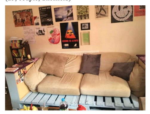
Clarissa's 'life-container' lodging room (47, single, Manchester)

Clara's 'self-furnished' livingroom (25, couple, Sheffield)