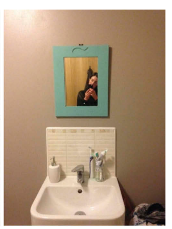
Figure 4. The ugly, the beautiful and the self.

exposed the tension between meaningfully assembling materialities of self and the transiency of these assemblages in response to the PRS's institutional tenure insecurity.