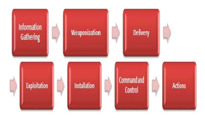
Figure 3. Intrusion Kill Chain.

of adversary conditions, stresses, or attacks on the cyber resources it needs to function.