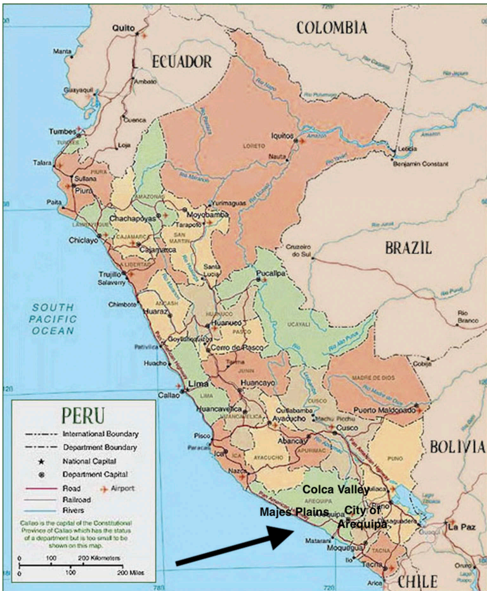
Figure 1. Map of Peru with site of fieldwork. Source: This map was downloaded from Vidiana.com (maps of the world). http://www.vidiani.com/large-detailed-relief-and-political-map-of-peru/ The arrows and place names have been added by the present authors.

vital resource in a year of drought. On several occasions, we also made joint participatory observation and informal interviewing in selected points of encounter between project stakeholders. To acknowledge the importance of the interviewees' collaboration and contribution to the data collection, we use their real names.