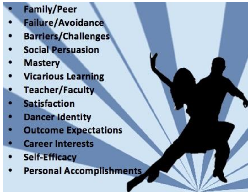
Figure 1. Tenets of social cognitive career theory for dancers.

of career performance and satisfaction. Figure 1 illustrates the building blocks, tenets, and influences of career identity for dance students in relation to SCCT.