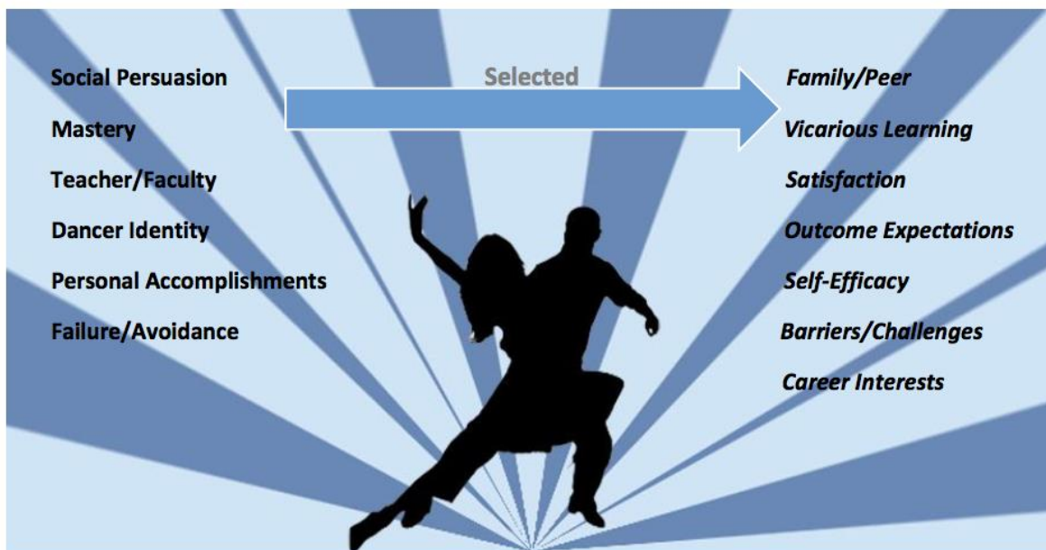
Figure 2. Selected tenets of social cognitive career theory for dancers.