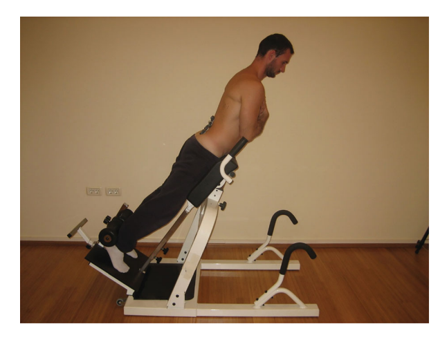
Figure 2. The tilting device used for testing with subject placed in starting position.

The high-pass cutoff frequency of 20 Hz was chosen as recommended to be optimal choice for general use [40].