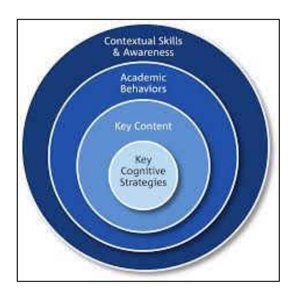
Figure 2.2. Conley's Elements to College Readiness

At present, college readiness accountability for the language learner rests with the general education classroom teacher. Pre-service teachers receive training in educational theories and practice, yet most are assigned to work with a diverse student population, with little or no diverse cultural or linguistic background. Ball (2009) and Dianda (2008) estimated that by 2020, the individuals ages 25-64 will be about 30% Latino and Black. Both groups have a high school graduation rate of below 60%. Investment in teacher preservice language course work, along with professional development in language acquisition is needed to support this exploding population of students.