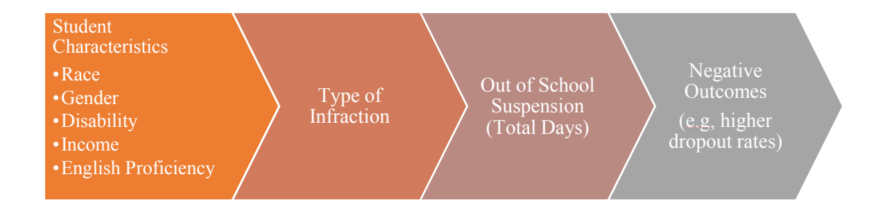
Figure 1.1: Framework of Suspension, Gender, disability, socioeconomic status, race, and number of days suspended.

The conceptual framework around which this study will focus is provided in Figure 1.1 below.