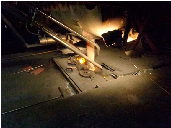
1 DSP mould and SEN

Scale formation at the slab surface. An illustration of the mould of the DSP, including pipes for semi-automatic powder feeding is given in Fig. 1.