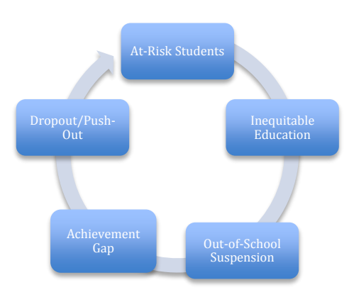
Figure 2.3. The Circular Relationship

Figure 2.3 below illustrates the concept that inequitable education is inherent in school systems with diverse learners which leades to discipline and academic problems. Those discipline and academic problems can lead to student dropout or inadvertently a push out school