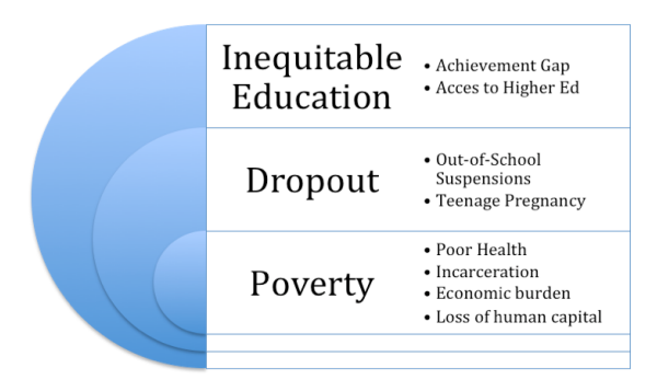
Figure 2.2. The Ripple Effect of Poverty.

The following Figure 2.2, shows the adverse consequences of an inequitable education system.