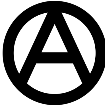
Figure 2: The “anarchist A” or “Circle-A,” another popular anarchist symbol.

resistance. One might also note that the symbol was adopted by the hardcore punk band Black Flag. It appears prominently in their shirts and on the cover art of their records—often alongside sensationalizing images such as a cop getting his head blown off or a nun spanking a child.