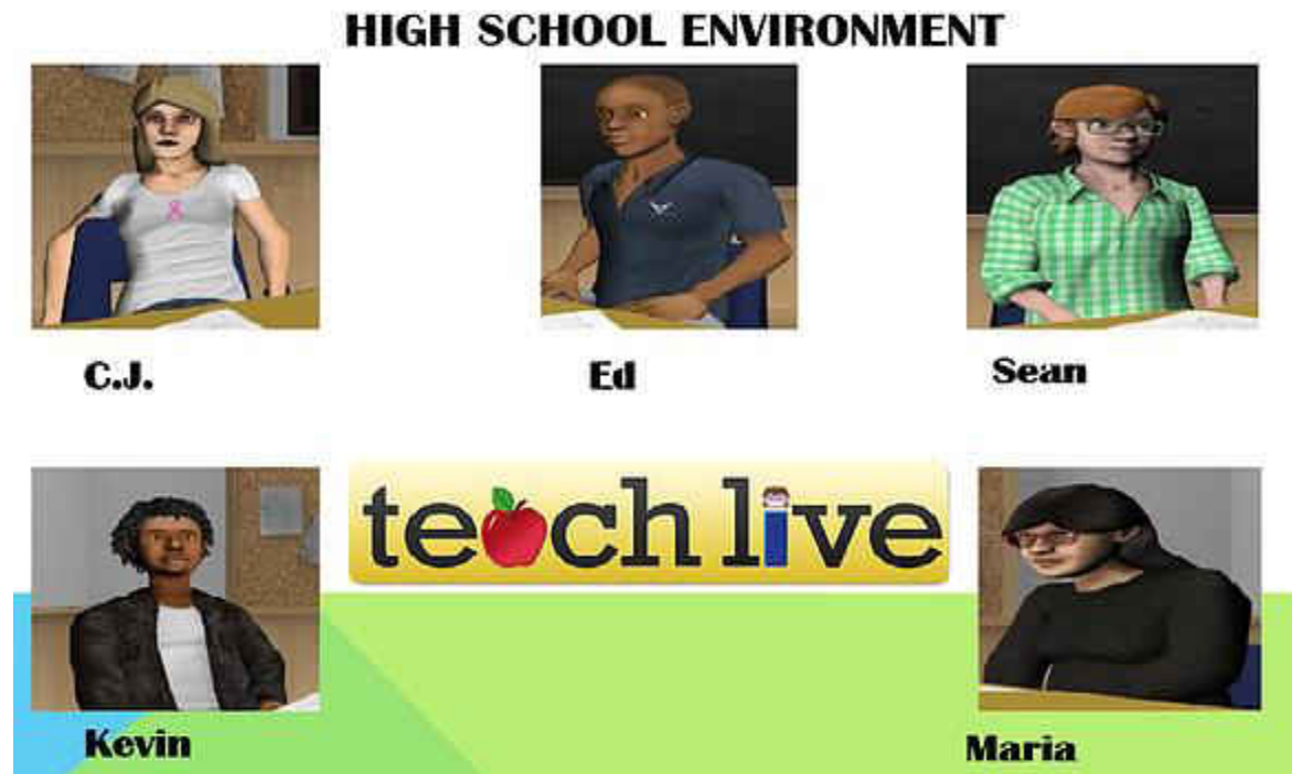
Figure 3: High school digital characters

some South American countries such as Mexico and Puerto Rico; Maria once traveled with her parents to East Asia.