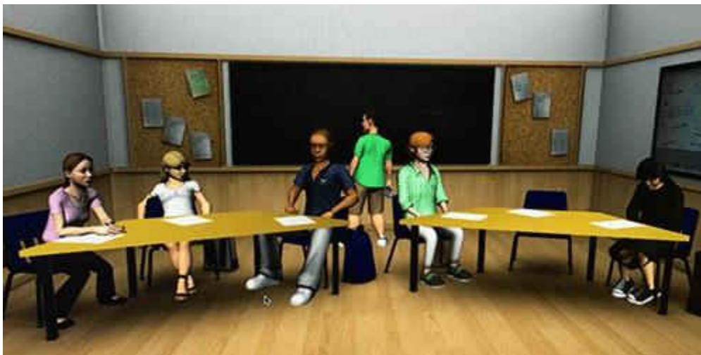
Figure 2: TeachLive high school virtual classroom environment

tables. The digital characters Kevin, CJ and Ed sit at the left table while Sean and Maria sit at the right one. Their backpacks are at their feet and the students are sitting casually in their seats. The whole classroom set is very similar to the most common high school or college classroom. The digital characters have different body poses and expression to show their mood or emotion but will not stand up and move around the classroom. The digital characters cannot talk at the same time. They can talk to each other but communication among the digital characters is not encouraged unless it is necessary since the major research question is to investigate the communication between ELs and the digital characters.