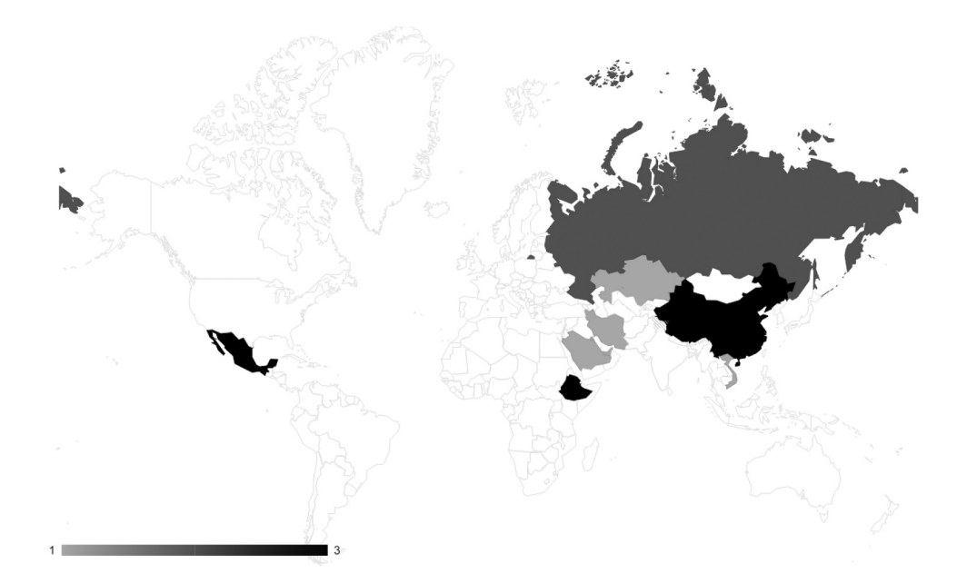
Figure 8. Independent reporting – attribution of targeted threats to civil society.