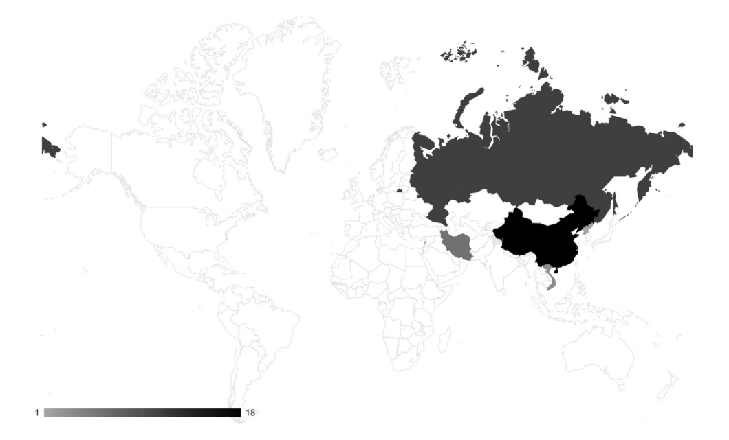
Figure 7. Commercial reporting – attribution of targeted threats to civil society.

'cyber powers', hence it is conceivable that they are the main perpetrators of threats to civil society.