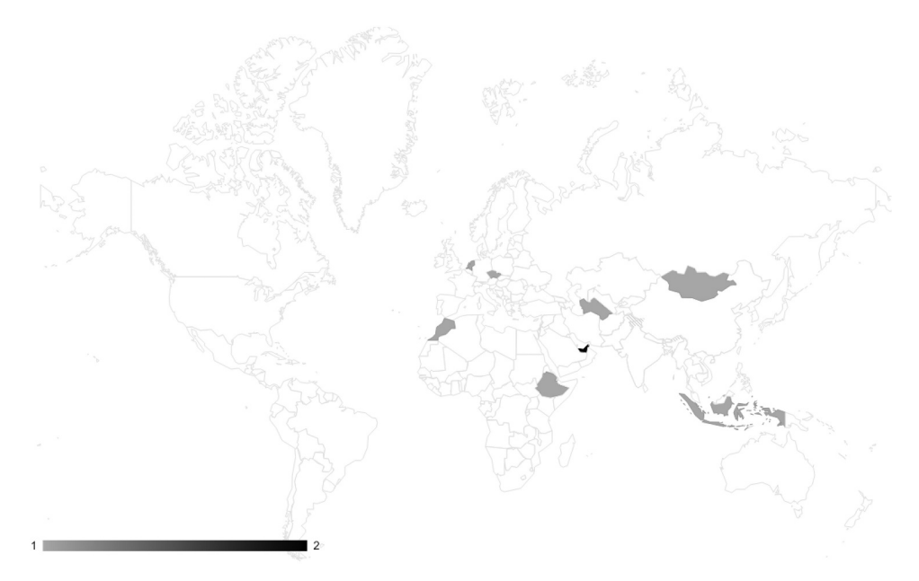
Figure 2. Independent reporting – commercial spyware infrastructure detection 2012.

H1 predicts a low proportion of reporting prioritizing threats to civil society, and is verified by the findings. As shown in Figure 1, only a small minority, 82 out of the 629 commercial reports analyzed (13%), discuss a targeted threat to civil society. A deeper look at prioritization of the issue within this subset of commercial reporting revealed that only 22 out of these reports (4% of total reporting) place their primary focus on civil society. Meanwhile, 30 reports (5%) place a secondary focus on civil society targeting, with limited analysis, and 30 reports (5%) mention civil society in