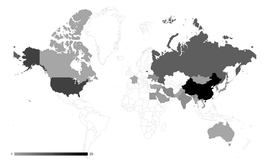
Figure 4. Commercial reporting – civil society targeting by country.