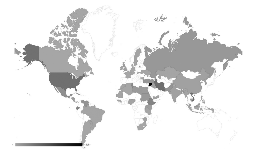
Figure 6. AccessNow – helpline data.