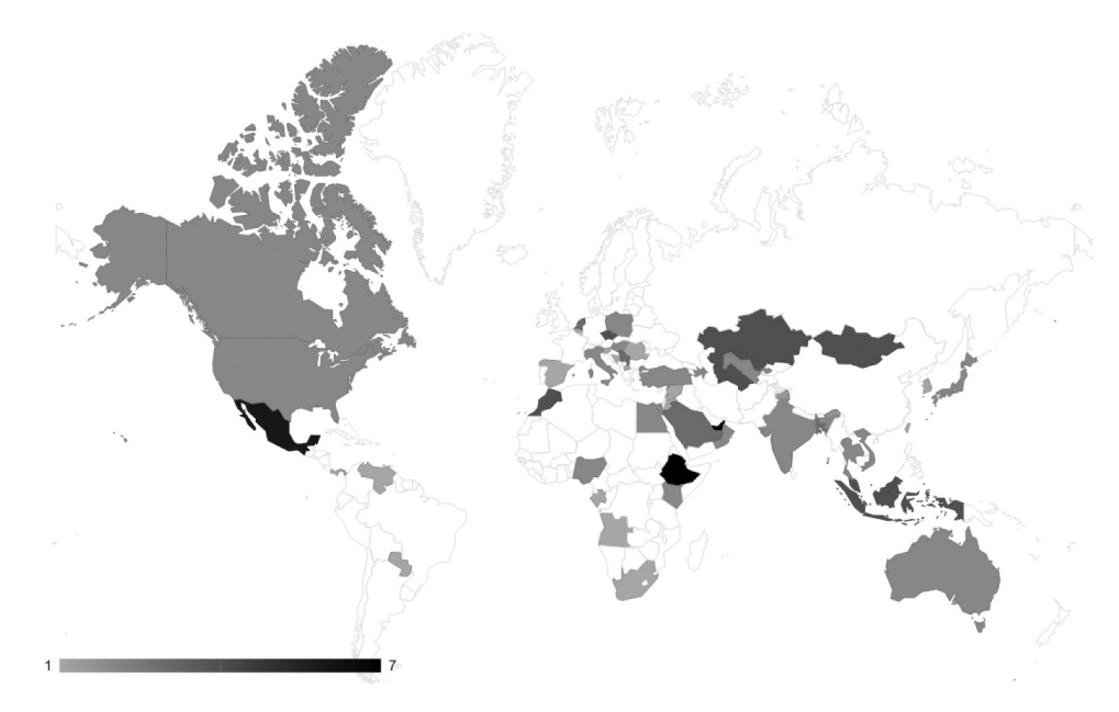
Figure 3. Independent reporting – commercial spyware infrastructure detection 2018.

Although this sample only covers 17 months (January 2016 – May 2018), it shows a much wider and more even distribution than commercial