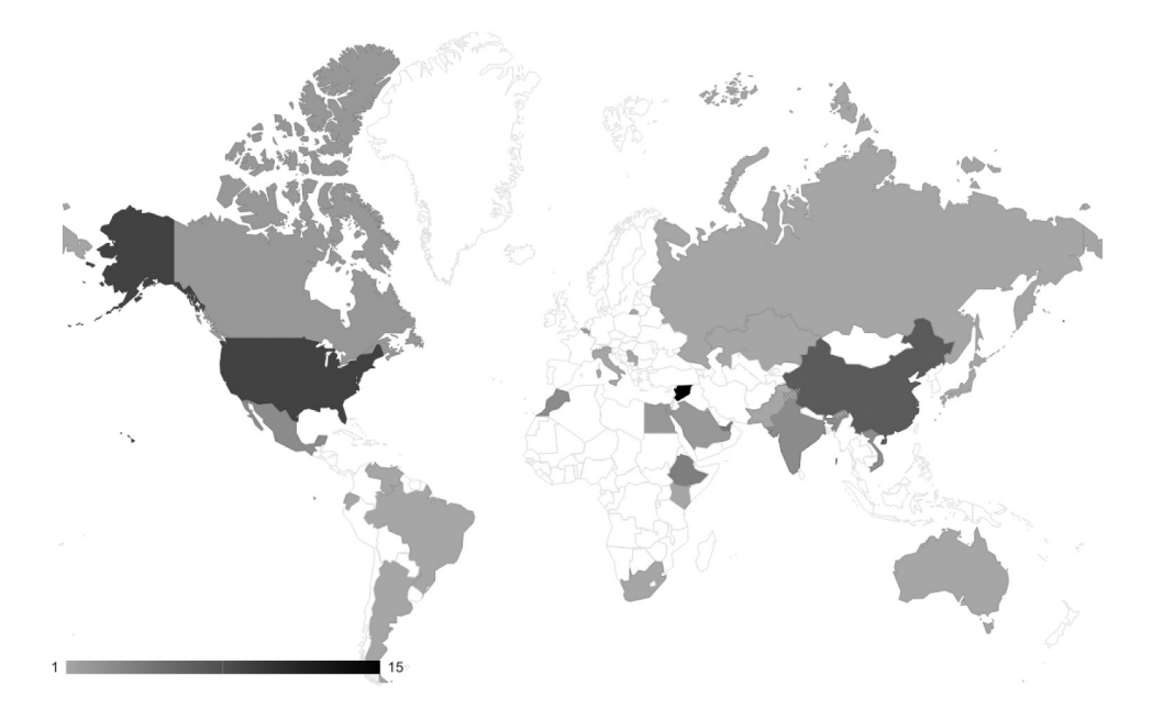
Figure 5. Independent reporting – civil society targeting by country.

reporting (Figure 4). There is a plethora of activity in the Global South that is missing from commercial reporting. Granted, these are very different sources of data and thus not easily comparable – nonetheless, the divergence reinforces the trend identified in the comparison above, thus providing further support to our hypothesis.