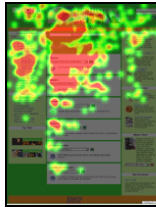
Fig. 2. Heat Map Pattern, SirsiDynix, 22 Feb 2006

Jakob Nielsen, one of the foremost experts on web design has researched the implications of the F-Pattern of eye movement in web design. In his report, “F-Shaped Pattern for Reading Web Content,” he discusses how the F-Pattern has three parts, and how they are navigated in a specific order. First, the eyes of the reader move across the top bar of the “F” in a horizontal pattern. Second, the eyes of the reader move across the second bar of the “F” in the same horizontal pattern, and third the eyes scan the left-side, forming the stem of the “F”. Nielsen argues that the speed of this final vertical step varies, but the pattern itself is typical. Neilson states that there are three implications of the “F-Pattern”. The first is that users will not read the text word-for-word; they will scan over groups of information. Second, they will read