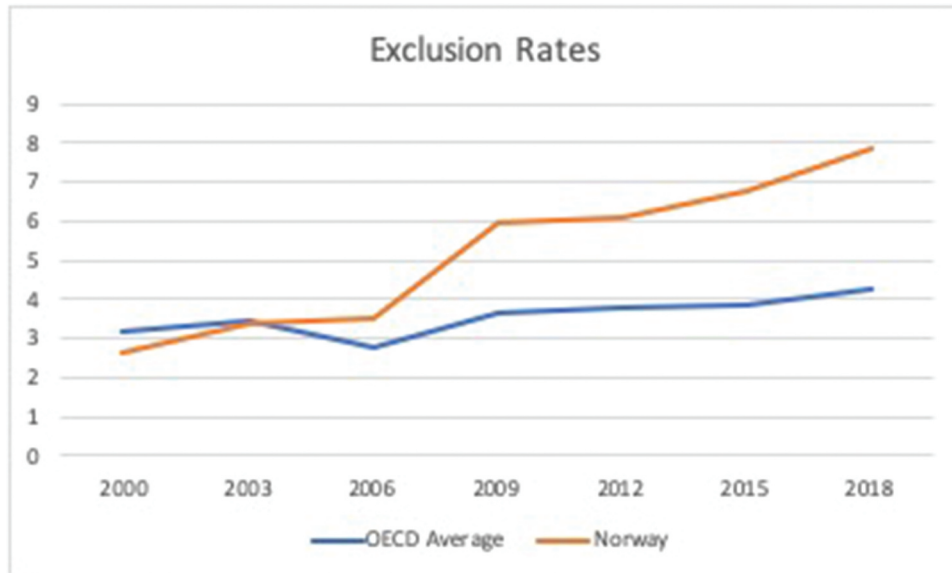
Figure 1. Norway's PISA exclusion rate from 2000 to 2018 compared to the average of 29 OECD countries participating in all cycles of PISA.

We do not expect that there was a concentrated effort by the Norwegian government to increase exclusion rates with an explicit hope of improving scores. However, this anomaly does deserve further investigation in order to understand possible explanations for the large increase in exclusion rates. In the following paper we interview a group of Norwegian educational leaders to explore