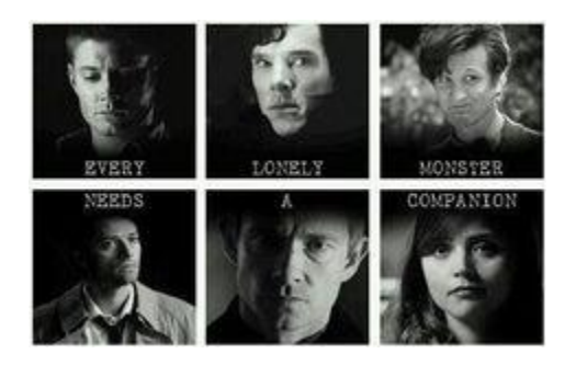
Figure 6: SuperWhoLock crossover values example

Though on the surface, the shows' views on violence seem divergent, there is an underlying similarity that might also appeal across fandom lines.