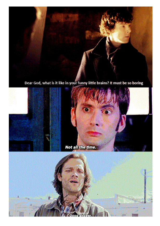
Figure 5: Fan work: SuperWhoLock crossover GIF series

The unique practice of the SuperWhoLock fandom is the creation of crossover images and GIFs. These could be thought of as a type of fan art, but it is distinct from the type of fan art common to most fan groups on Tumblr. These SuperWhoLock specific crossover images involve existing scenes and dialogue from the individual shows, put together in such a way as to tell a crossover story. Some are slightly altered, some entirely rewritten, but many are kept with the same dialogue as in the original scene (e.g. Figure 5).