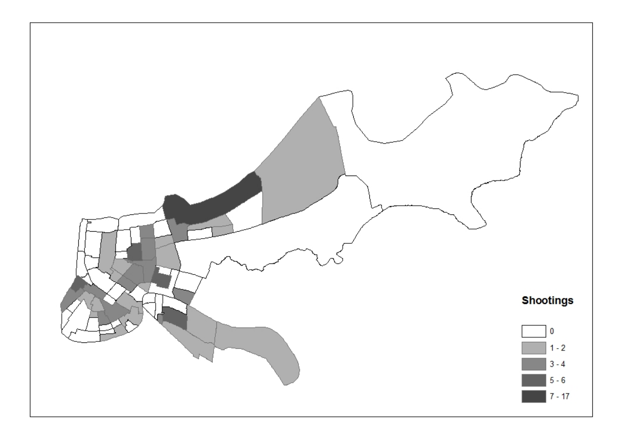
Figure 2. Shooting Counts by Neighborhood.