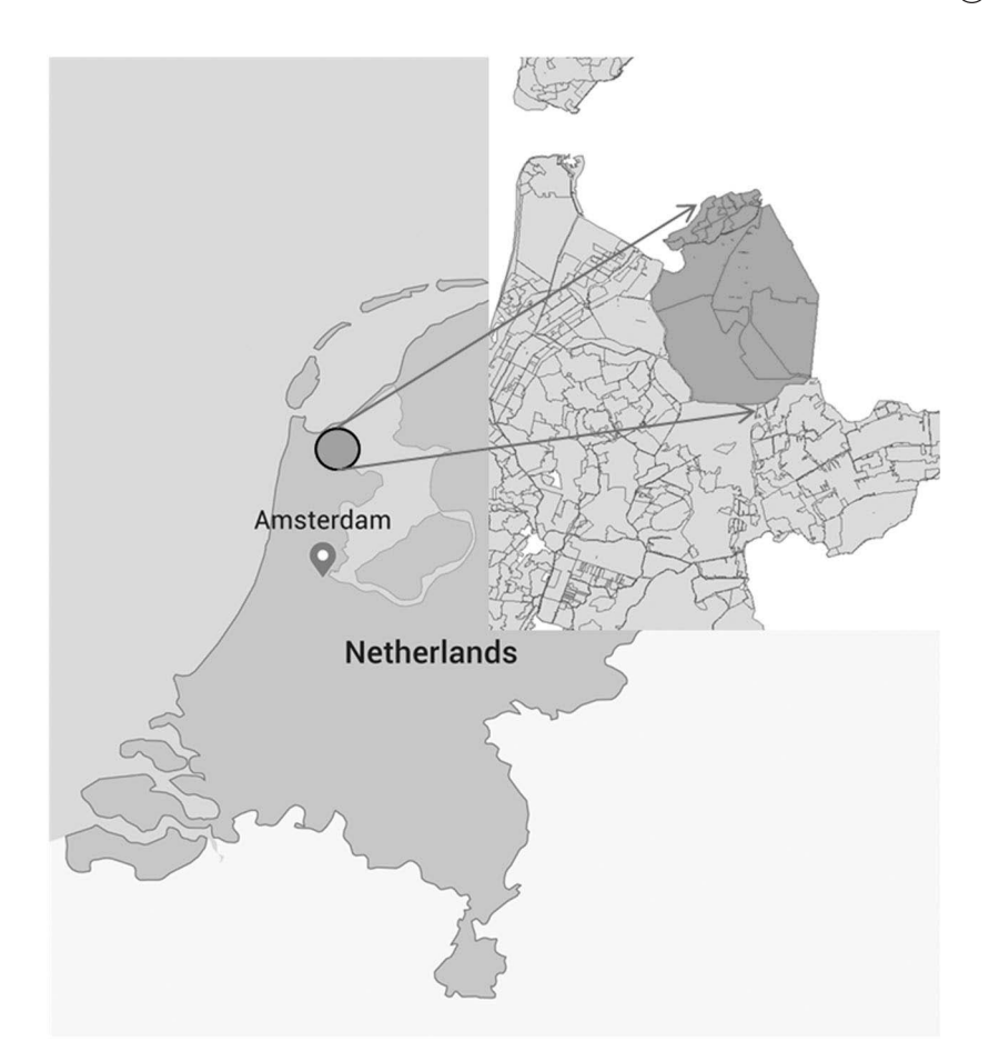
Figure 1. Case study area (dark grey in inset).