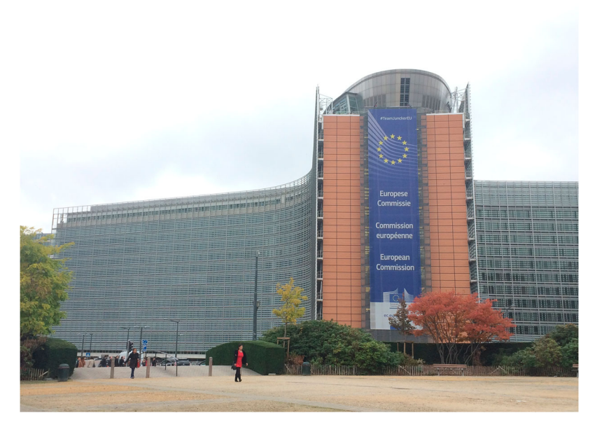
Figure 3. EU Commission, Berlaymont building, Brussels, 2017.

sustainable, adaptable to 'the Institution's evolving needs as well as those of society', and importantly block A of the historic Résidence Palace had to be salvaged. <sup>69</sup> Moreover the design had to: