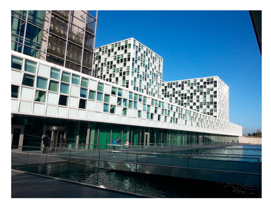
Figure 2. The International Criminal Court entrance, The Hague, 2017.

belongings, including mobile phones, must be stored in the lockers in the basement. Before accessing the courtrooms visitors must pass another security check. On the public galleries the Rules of Decorum apply: visitors are requested to be silent, pay attention, and to dress suitably.<sup>36</sup> The gallery is separated from the courtroom by a thick glass wall.<sup>37</sup> Again, transparency and inaccessibility operate in tandem.<sup>38</sup> The building communicates inclusiveness as much as exclusion.<sup>39</sup> Conveying inclusivity is imperative for an institution that claims to act on behalf of a global community, but the building itself follows the rationale of sophisticated 'segmentation and segregation'