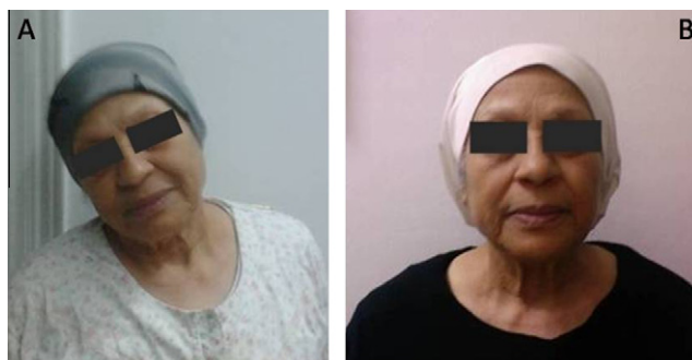
Figure 4 Patient with right laterocollis. Before (A) and after (B) operation.