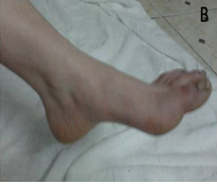
Figure 4 Equinus deformity with flexion of the toes. Before (A) and after (B) surgery.

results. Group 1: Reduction of three or more grades was considered excellent, group 2: reduction of two grades was considered good, group 3: reduction of one grade was considered faire, and group 4: no grade reduction was considered poor. All patients had immediate initial improvement of their spasticity. At the last follow up examination period, excellent results were obtained in 50% of patients, good results in 31% of patients, fair results in 13% of patients, and poor results in 6% of cases. In excellent and good results, the reduction of spasticity was accompanied by complete withdrawal of medications.