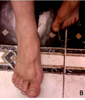
Figure 3 Equinovarus deformity with flexion of toes. Before (A) and after (B) surgery.