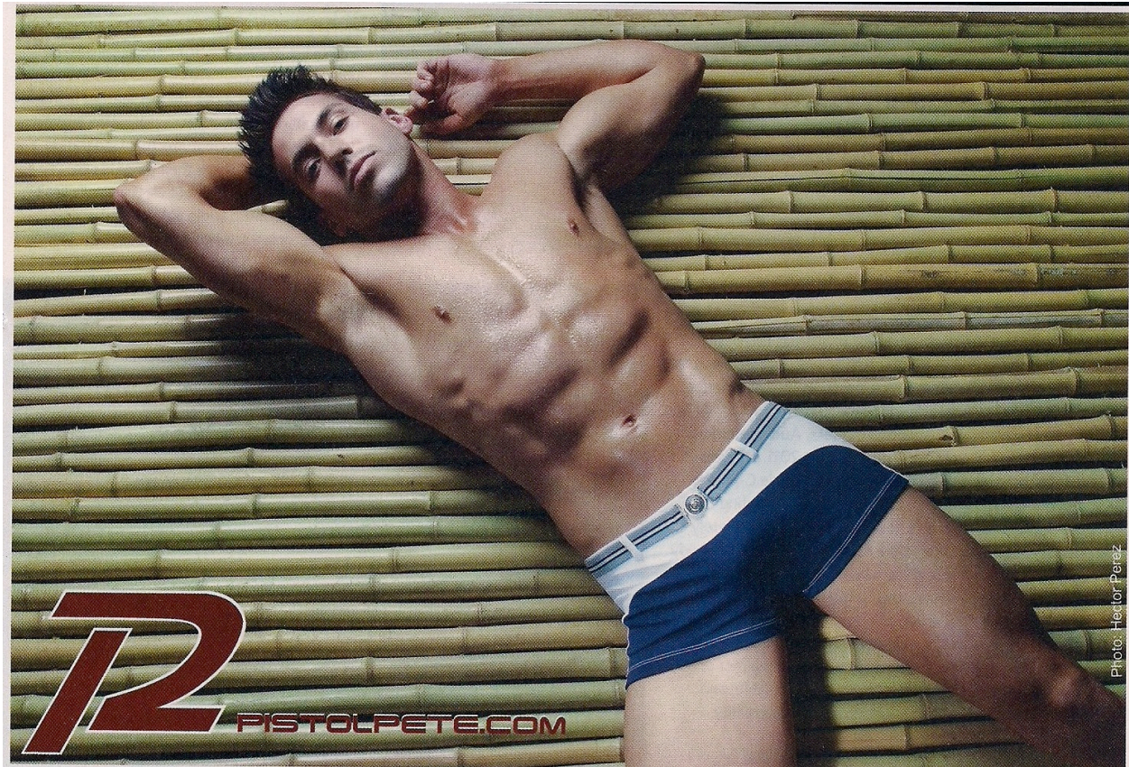
An advertisement for Pistol Pete shows the typical ad with undress.