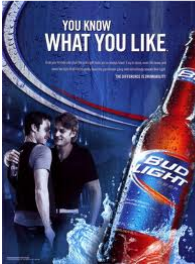
An advertisement for Budweiser shows the typical ad with alluring behavior.