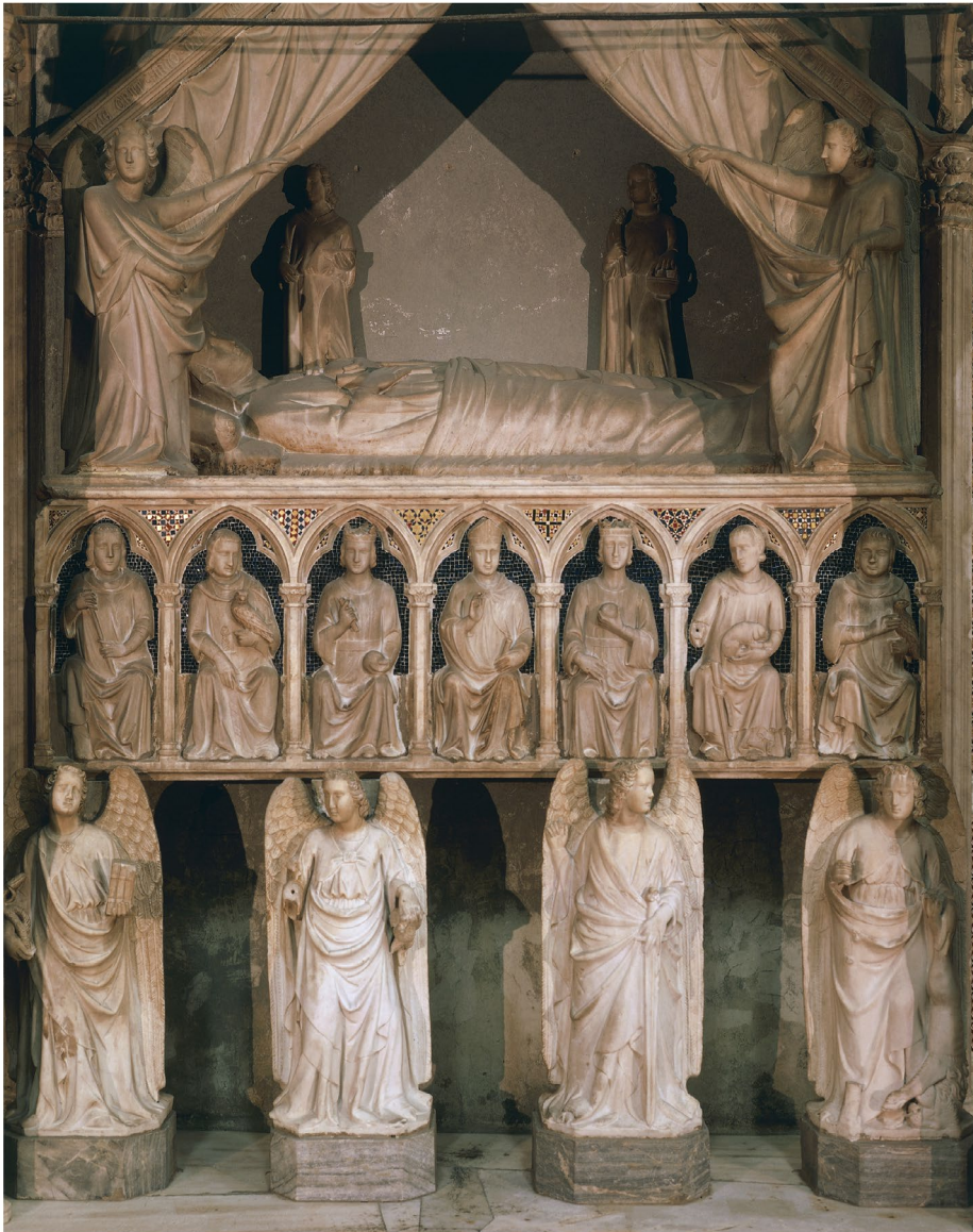
Figure 3. Tino di Camaino, tomb of Maria of Hungary, Sta Maria Donnaregina Vecchia, Naples, c.1326.

Jerusalem’ remains blank (ff. 57v–59r). Finally, next to the space where the portrait of Robert should sit, there is the head of his nephew Carobert as king of Hungary, with a note that invites the reader to turn back and read about the lineage of Hungary: ‘For this Charles see above, where it talks about Andrew, his predecessor’ (f. 59r). 58 King Edward II of England is depicted with a note: ‘Edward, the son, reigns’ (f. 59r) (Figure 4). 59 This final part of the manuscript must therefore have been completed before news of his deposition in January 1327 reached Avignon.