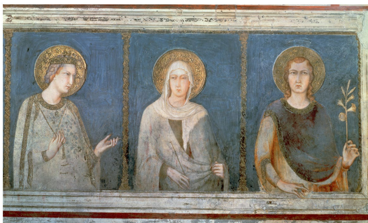
Figure 5. Simone Martini: St Elizabeth, St Margaret, and St Emeric (Henry), Basilica of St Francis, Assisi, 1318.