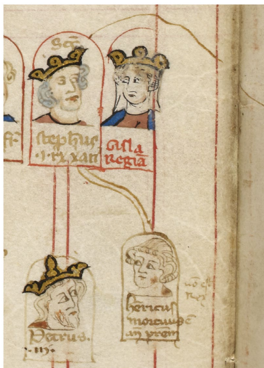
Figure 6. BL Egerton 1500, f. 42v (detail). St Stephen I (r. 1000–38) and his queen Gisela of Bavaria, above his successor Peter Orseolo (r. 1038–41, 1044–46). St Emeric ('Henricus') is depicted in a secondary branch with a crown that has been erased and a note: 'non fuit rex' [he was not a king].

uncrowned son, St Emeric (d. 1031), who is depicted in Assisi with what Hoch describes as an 'unfinished crown hovering over [him]'; suggestive of 'a potential rule curtailed' (Figure 5). 70