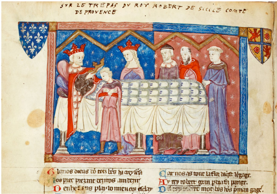
Figure 1. Paris, BnF MS fr. 1049, f. 14v. Robert of Anjou crowns Andrew of Hungary.

Another, produced in Avignon in the period 1321–24 when Robert's court was in residence there, removes the king's face from a genealogical scheme. Once again, the problem appears to lie with Robert's disputed claim to his own throne. This ambivalent portrayal of Robert appears in L'Abreujamen de las estorias , an Occitan version of a universal chronicle that is variously entitled Notabilium historiarum epithoma (c. 1313), the Compendium historiarum (Venice, Avignon, and Naples, c. 1321–29), and the Satyrical historia (Naples, c. 1331–39). None of the fourteen extant manuscripts name an author of the chronicle, but it is agreed that it is the work of Paolino Veneto (c.1270–1344), a Franciscan friar and prelate whose career from the 1320s to his death was closely connected with the Neapolitan royal court, and especially with Robert himself. 4