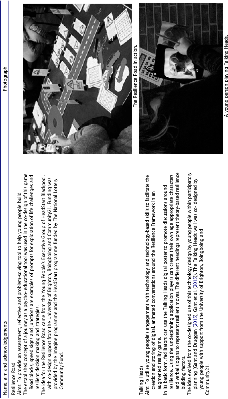
Table 1. (Continued).