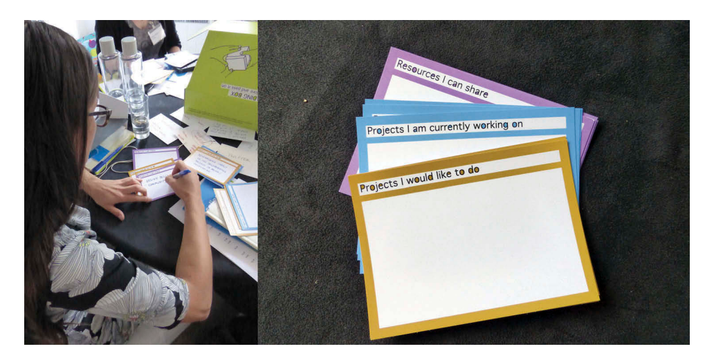
Figure 1. Cross-pollination materials.

The key characteristic of the materials and process used was that they were designed to give to participants the time, space and resources to express their norms, values and practices and to discover how these relate to others. All participants felt that they had an equal say in defining research questions and methods (a task traditionally dominated by researchers), but also an equal status in defining social action projects (a task typically shaped by social change organisations). The process naturally created sub networks that connected different social worlds and their resources around a number of local projects.