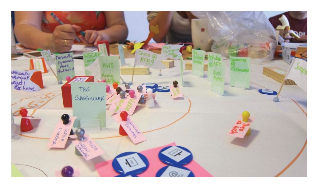
Figure 4. Asset mapping exercise.

The asset mapping process and the associated materials used (the map and the objects representing the group's assets) allowed a 'resonance' between individuals and their community: namely individuals became more visible within their social context and the social