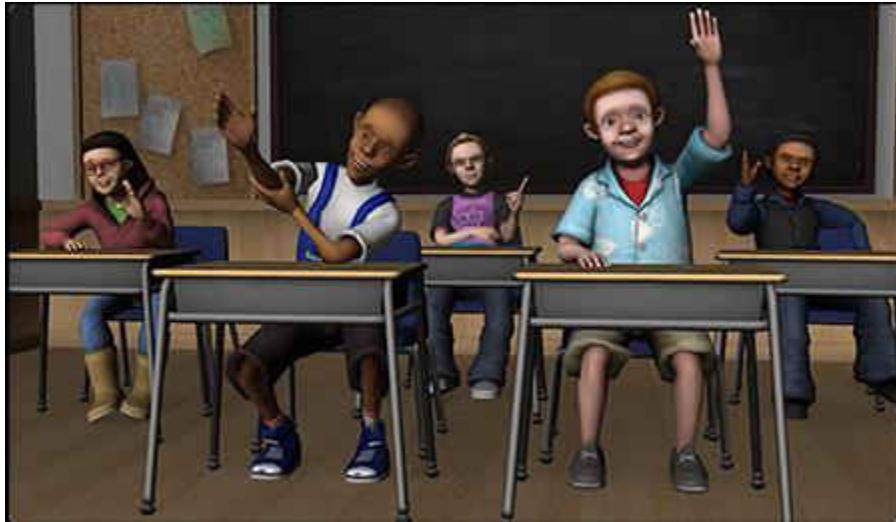
Figure 1 TeachLivE™

connections, life experiences, engagement and assessment of prior knowledge. Figure 1 below is an example of the TeachLivE™ simulated classroom.