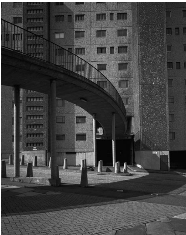
Figure 3. High-rise flats in Wester Hailes in the 1980s; image courtesy of RCAHMS.

My Gran lived at 4/16, i loved growing up here as i child, tell my kids n friends about the good old days in the high rise, it was like its own little comunity, an how we used to play hide n seek inside the block when it was bad weather, lovely memories from here B-).