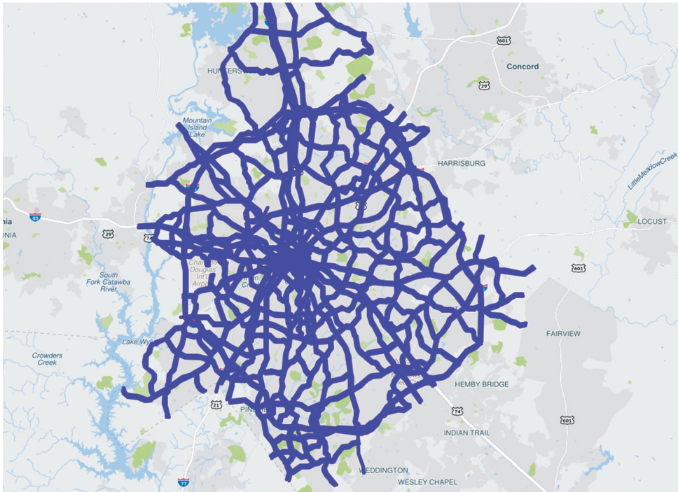
Figure 1. Selected road links.

traverse the road link, and a score (30 indicates real-time data; 20 indicates real-time data across multiple segments; 10 indicates historical data).