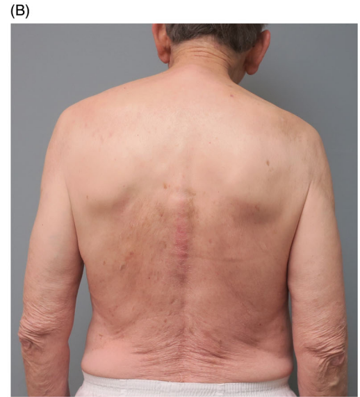
Figure 2. Representative Clinical Photographs of a Patient with CPUO Treated with Dupilumab. (A) Excoriations on Back Prior to Dupilumab Treatment. (B) Visibly Cleared Back with Faint Erythema After Treatment for 4 Months with Dupilumab.

efficacy of dupilumab in this highly debilitating medical condition which currently lacks effective therapies.