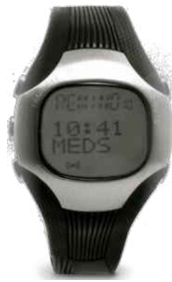
Figure 1: The WatchMinder2 Vibrating Watch and Reminder System

Student Paper-and-Pencil Performance Graphing Worksheet (see Appendix F)-During the intervention and maintenance phases, participants transferred the data from their academic productivity recording forms onto the graphing worksheet providing each participant with a running visual representation of their academic productivity behavior for the week.