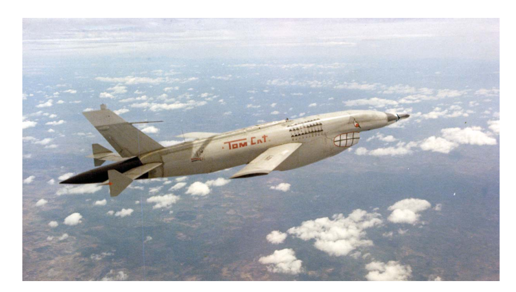
Figure 5. U.S. Air Force AQM-34L Firebee drone, 1969. (Color figure available online.)

piloting a U-2 spy plane. As a result, the Eisenhower administration scrambled to replace its manned reconnaissance program. In 1962, the year of the Cuban missile crisis, Ryan Aeronautical Company was given money from the U.S. Air Force's Big Safari research funds to develop surveillance drones. Ryan went on to modify its jet-powered Firebees, creating a family of drones that went by several designations: Ryan 147, AQM-34, and the commonly used Lightning Bug (Figure 5). Launched from a Lockheed DC-130 Hercules airplane, the Lightning Bugs flew preprogrammed routes or were piloted by Airborne Remote Control Officers on board the Hercules. After performing their surveillance mission, the Lightning Bugs deployed their parachutes and were scooped up by helicopters under the guidance of Drone Recovery Officers. The Lightning Bugs were flown under the auspices of the U.S. Strategic Air Command and were used for surveillance across a wide Cold War battlespace, including Cuba, North Korea, and the People's Republic of China. Between 1964 and 1975, Lightning Bugs flew more than 3,500 combat sorties in Vietnam (Ehrhard 2010).