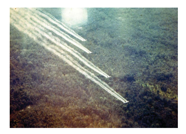
Figure 3. UC-123 aircraft on a defoliation flight as part of Operation Ranch Hand. (Color figure available online.)

One of the most controversial elements of the Vietnam War was the use of chemical defoliants such as Agent Orange. The U.S. military's defoliation program aimed to strip the forests of life, reducing the cover for the NLF, particularly along the Ho Chi Minh Trail. This was the main logistical network of supplies to the South that wound through Laos and Cambodia. Around 72 million liters of herbicide were dumped across South Vietnam, including 42 million liters of Agent Orange (Palmer 2005). This spraying represented around a seventh of South Vietnam's total land area (Gibson 2000). The first defoliation flights took place on 28 November 1961. The Air Force modified UC-123 aircraft for the missions, which became part of Operation Ranch Hand, lasting until 1971 (Frankum 2006; see Figure 3). For years following the spraying, only uncultivable plants would grow in extensive white zones. When wildlife wasn't deliberately targeted by the U.S. military-as it