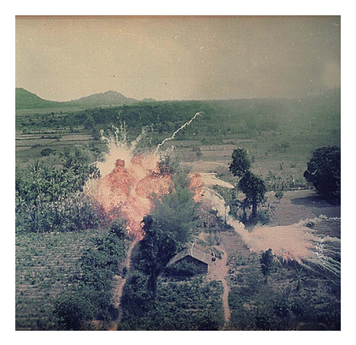
Figure 2. U.S. napalm bombs explode in South Vietnam, 1965. (Color figure available online.)

Although actor-network theory has continually brought attention to the objects and relationships that produce state power (Latour 2005), atmospheric power highlights the spheres, encasings, and enclosures that wrap themselves around the terrain, containing humans and nonhumans within hybrid, multidimensional warscapes. "Thinking through atmospheres," explained Adey (2014, 835), "helps us to extrude networked security into immersive enveloping shapes in which the subjects in and of security might be caught. Thus, understanding a security dispotif through