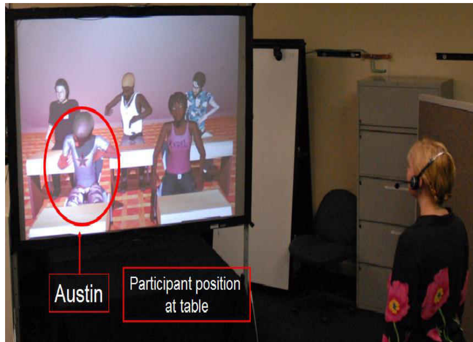
Figure 1: Researcher speaking to class of avatars in the virtual classroom laboratory