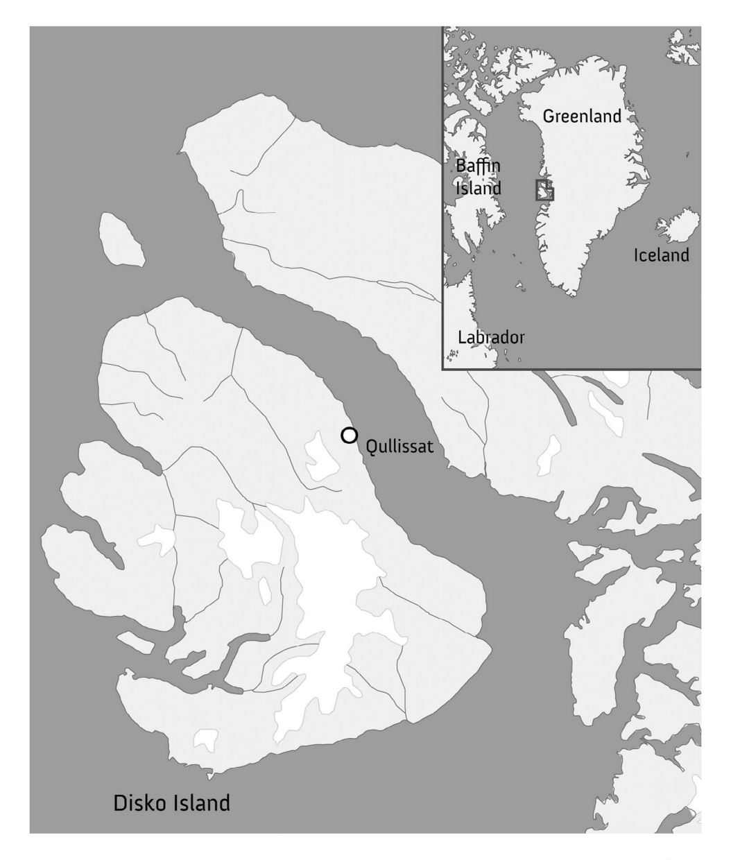
Figure 1. Disko Island in western Greenland. Map created by, and published with the permission of, Hans van der Maarel.

Now, it was the mineworkers of Qullissat, rather than seal hunters in small settlements, who stood for the modern Greenland that reformers imagined. Against this backdrop, the closure of the Qullissat coalmine and the resettlement of the community in 1972 were marked by confusion. For those affected by the closure, it was unclear whether the Danish authorities or Greenlandic representatives were responsible for the final decision to abandon