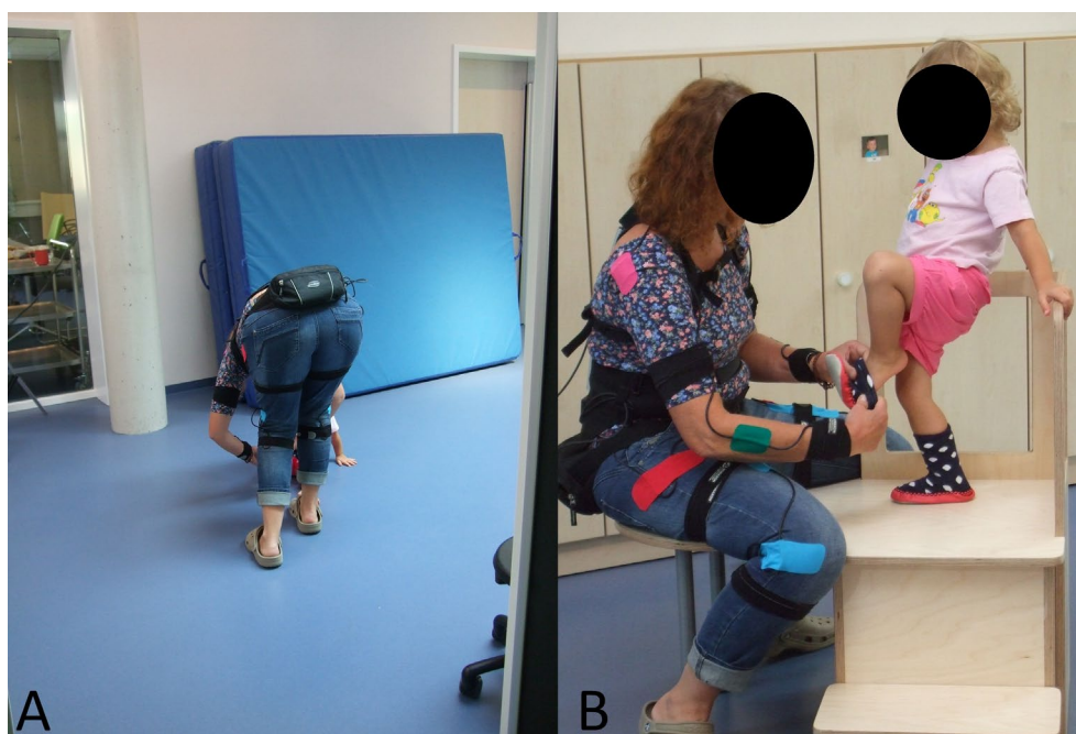
Figure 3. The preschool teacher's posture in the pre-intervention phase (A) and post-intervention phase (B) for the task of assisting children getting dressed.

The data were processed using the CUELA software, which allowed for the synchronisation of the video and CUELA data in addition to the assignment of intervals for specific