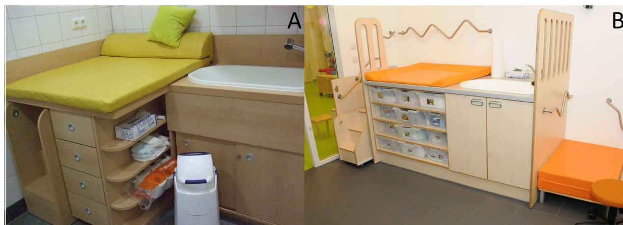
Figure 4. The diaper table used in the pre-intervention phase (A) and the one used in the post-intervention phase (B) that through the new design reduced the likelihood of lifting the child onto the table.