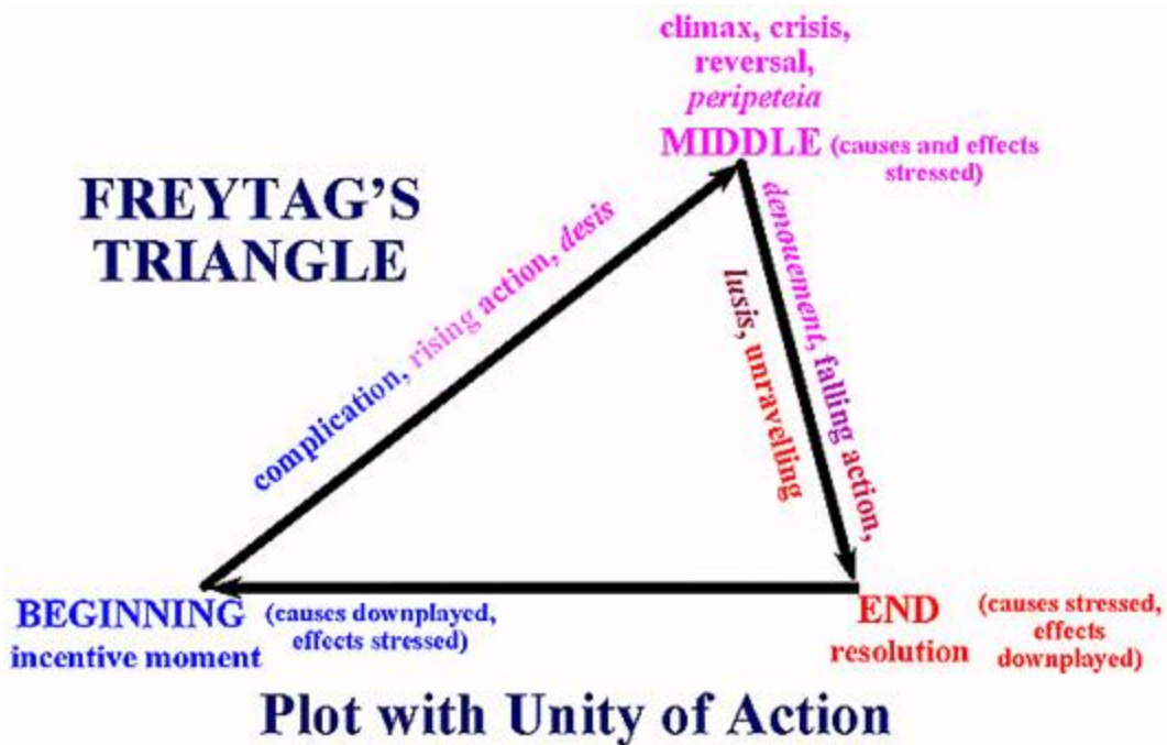
Figure 2: Barbara McManus's Representation of the Freytag Pyramid

The Beginning of action is a rise in a set complication, or problem, which the actors must recognize and begin to react to. This stage is where persons begin to sense that something is awry. The arrow trends upwards showing that there is still an apex of concern to occur and that the complication will only become worse before better.