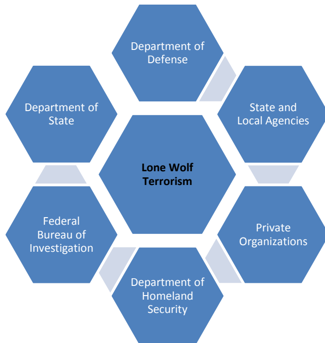
Figure 3: Direct Actors in Relationship to Lone Wolf Terrorism

agencies and various other actors that are directly and indirectly affected by a terrorist threat and/or attack. Also, private organizations are included. Private organizations include non-profits like the Red Cross and Salvation Army, private contractors and businesses, hospitals and others.