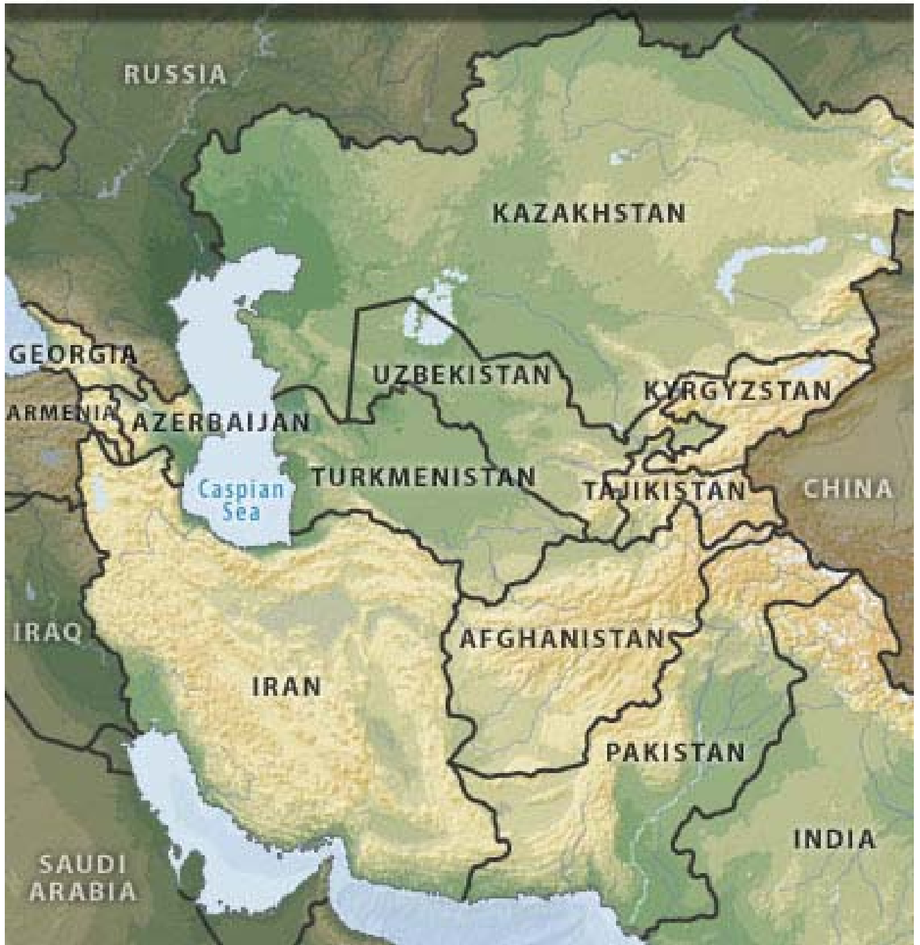
Political Map of the Caucasus 1.3