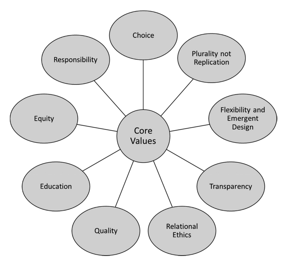
Figure 1. Core values underpinning the considerations for engaging in open qualitative research practices.