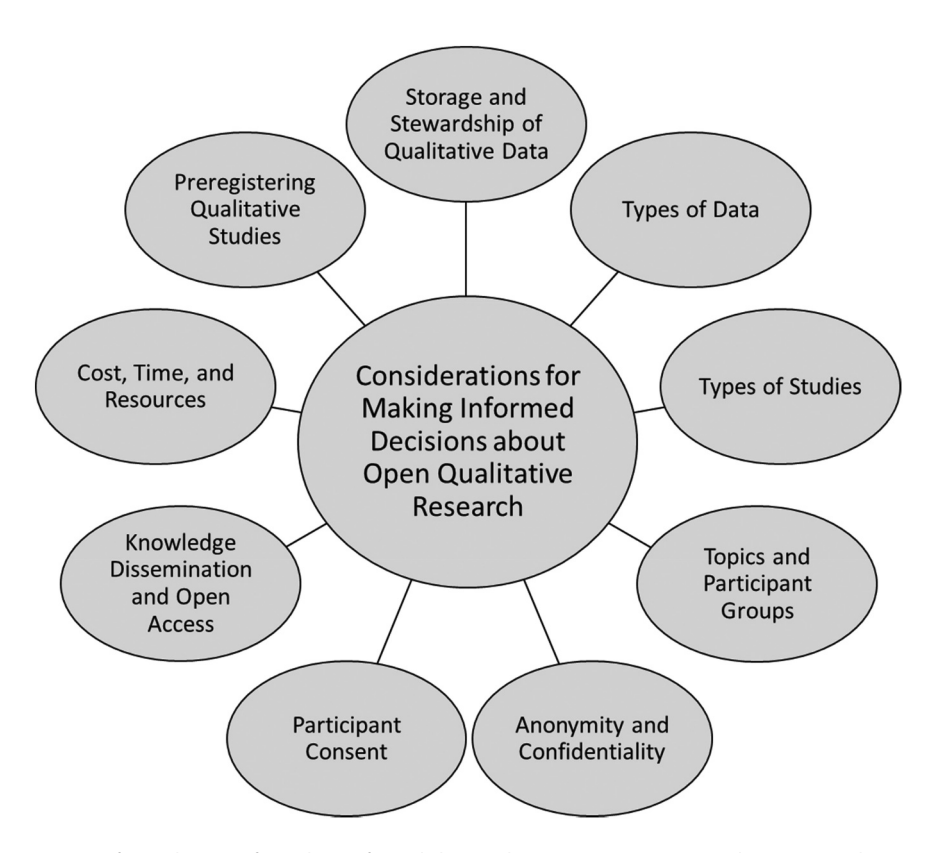
Figure 2. Overview of considerations for making informed choices about engaging in open qualitative research.

and (c) what levels of security are necessary for the data and project materials (see Figures 3 and 4). Depending on the topic of inquiry, the type of study or methodological approach, the types of data and materials to be stored, and the participant groups and risk of identification, researchers may choose to store qualitative project materials and data in online repositories, or they may determine that it is not appropriate to make the data and materials available online for future research and teaching purposes. A 'least-restrictive' option is to store data and materials in an online repository with no restrictions on access to the data or materials; this is viewed as the 'least secure' option for minimally-sensitive data and project materials, as anyone can view, download, and use the files. A more restrictive option is the storage of project materials and data in an online repository, where access to the data is managed by the primary researcher, who decides whether to grant access in response to requests from others to view and use the files. Researchers could also provide 'stepped access' to make some files and data openly available, while other data or files with more sensitive or potentially identifying information can be shared upon request or following more stringent access procedures (e.g., following ethics approval to access the data; McGrath and Nilsonne 2018).