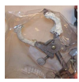
Figure 6. Tong with Sleeve

Our goal was to better understand the potential asbestos exposures to which workers would have been exposed in these settings. The conditions we simulated were expected to generate exposures under "a worst case scenario," in conditions intended to be more austere than the average exposure in the simulated setting.