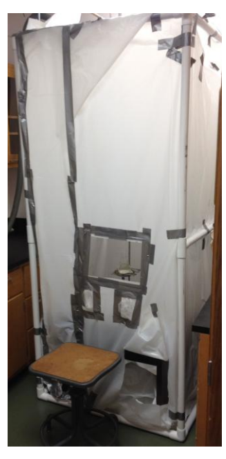
Figure 2. Chamber for Test 3

To-date few studies have documented exposure assessments in the research lab. And the few published articles have included only one type of product, so far gloves and mitts. In order to assess potential exposure risk while performing research in labs with asbestos-containing supplies, we conducted a series of experiments in an enclosed environment such as an environmental chamber (Fig. 2); or testing included wire gauze pads (Fig. 3), gloves (Fig. 4), tongs (sleeves or socks; Fig. 5), and Transite (Fig. 6).