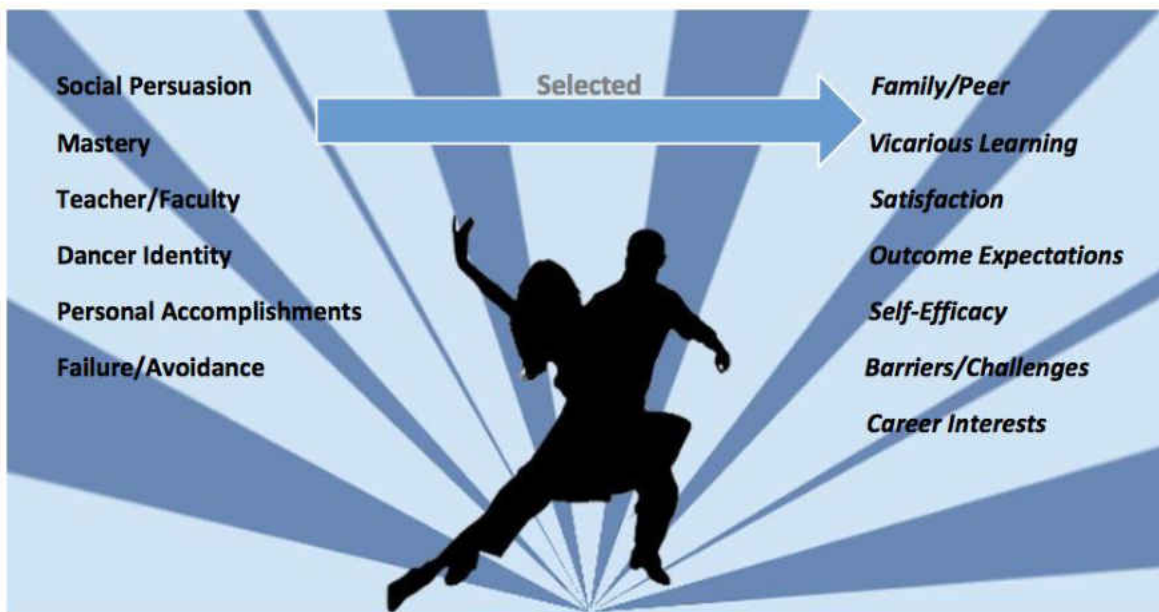
Figure 2. Selected tenets of social cognitive career theory for dancers.