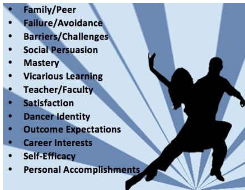
Figure 1. Tenets of social cognitive career theory for dancers.

of career performance and satisfaction. Figure 1 illustrates the building blocks, tenets, and influences of career identity for dance students in relation to SCCT.