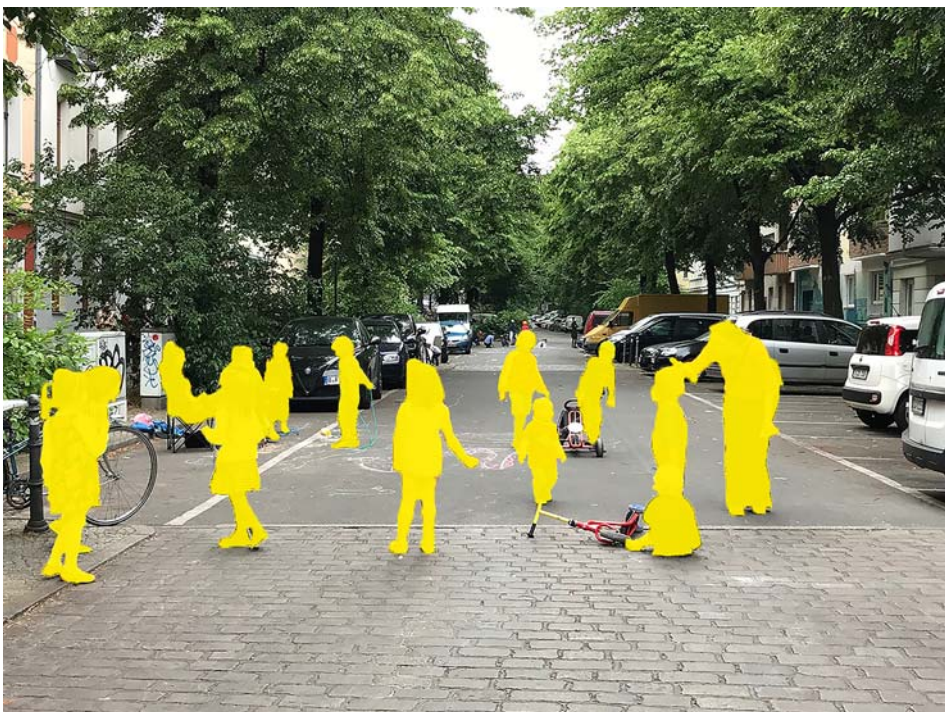
Figure 5. Children taking over streets as playspace.

While children welcomed this newly won play space, young people are still struggling with adapting their spatial practices to the given hygienic guidelines. Further, comments of young people in the JuCo study also suggest that they are aware that they are, effectively, missing out important experiences of what it means to be an adolescent and growing up in general. It is evident that the ongoing measures have made some spatial practices and activities for young people limited or non-existent, such as dancing at clubs, attending concerts, parties, internships or study and work abroad programs, meeting fellow students at universities, etc. (Nürnberger 2020). In June 2020, spontaneous parties organized by young people escalated and police were attacked in major cities (e.g. Berlin, see Morgenpost 15.6.2020 ; Stuttgart, see Manz in ZEIT 28.6.2020 ). While these clashes can be seen as reminders of the underlying and taken-for-granted perception that young people are deviant and troublemakers (with which media and police campaigns are infused), they could very much also be seen as means whereby youngsters are fighting back superimposed regulations and enforced supervision in these ‘pandemic times’ – or, to put in another way, as ‘daring to bite the hand pulling the strings’.