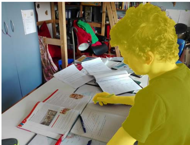
Figure 1. Home taken over by schooling. Children completing school work in their rooms, the kitchen and the living room (where a parent has her home office set up at the same table while constantly answering the questions of her children).