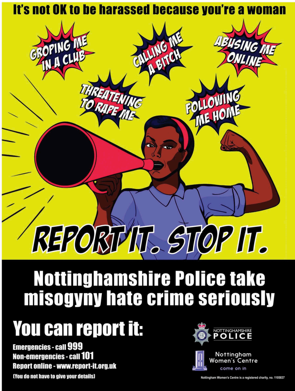
Figure 3. Nottingham Police take misogyny hate crime seriously.