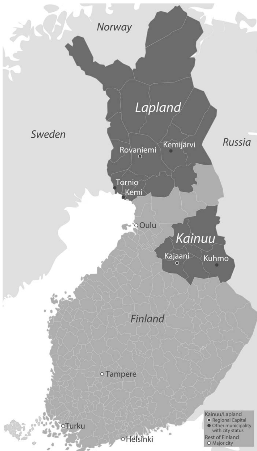
Figure 1. Lapland and Kainuu, and the regional capitals and other municipalities with city status in the two regions, viewed in the context of major cities in Finland.