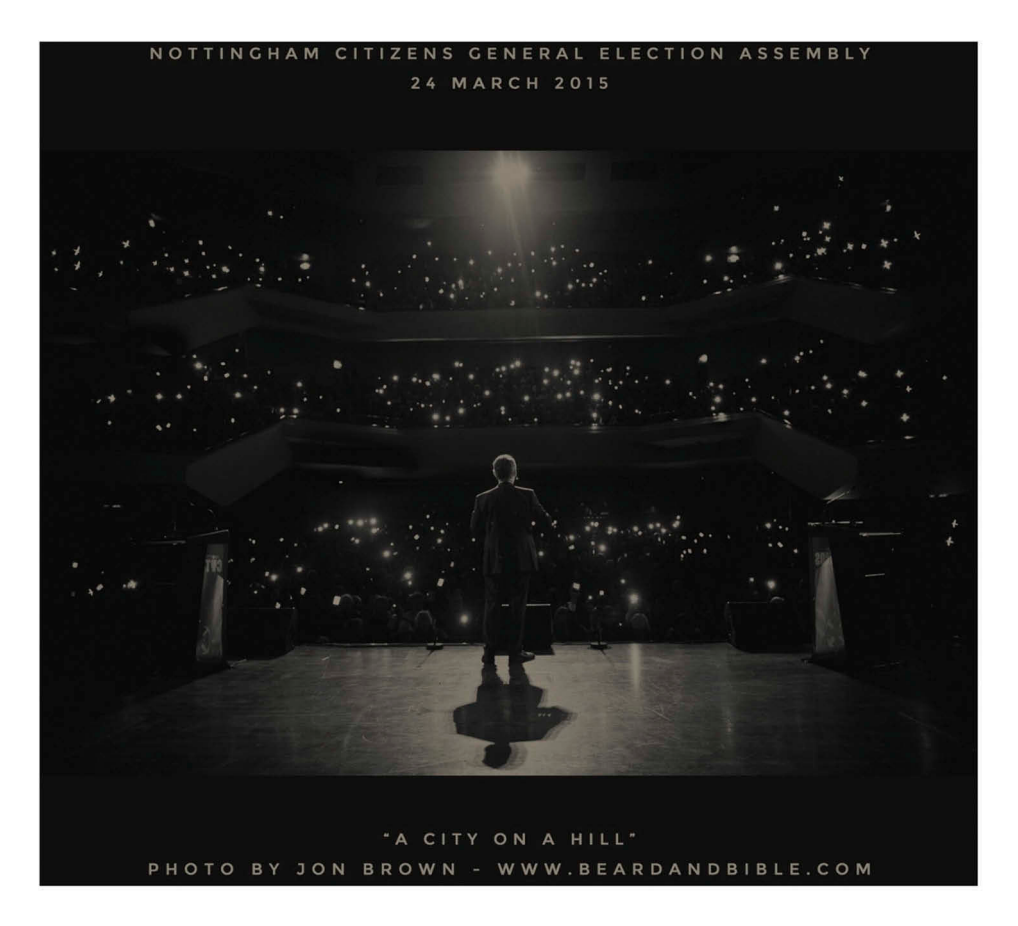
Figure 2. A city on a hill, the Nottingham citizens general election assembly, 24 March 2015. http://www.beardandbible.com/blog/2015/getting-the-shot?rq=citizens. Permission to use the image granted by the photographer, Jon Brown.

branding of this image and of the subsequent communications about the event as the dreaming of Nottingham as a 'city on a hill', and the religious symbolism this implied, made some members uneasy (see section on critique below).<sup>4</sup>