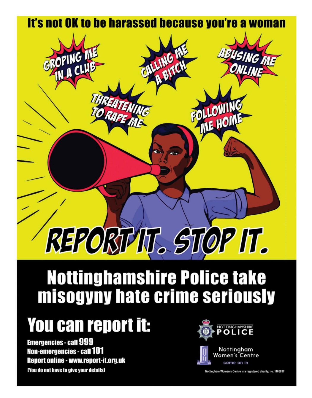
Figure 3. Nottingham Police take misogyny hate crime seriously.

From https://twitter.com/nottswcentre/status/848924982361165826. Permission to use granted by the Nottingham Women's Centre.